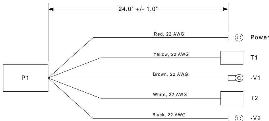
Figure 3. Cable Drawing