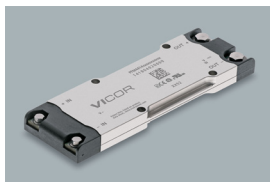
PFM AC-DC converters

Output: 24 or 48V Power: Up to 400W Peak efficiency: Up to 92% 110.55 x 35.54 x 9.40mm