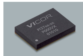
ZVS buck-boost regulators

Input: 8 – 60V Output: 10 – 54V Power: Up to 200W Peak efficiency: Over 98% As small as 10 x 14 x 2.5mm